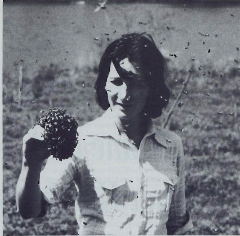
A student with a small swarm of African bees.

Some of the African stock was accidentally released in Brazil before it had been fully evaluated and integrated into a planned breeding program. Nevertheless, the introduction of African bees in Brazil has been a great success; more honey is being produced in Brazil than at any time in its history. Most Brazilian beekeepers are not even familiar with the more gentle European honey bees. However, some beekeepers have selected less aggressive bees from