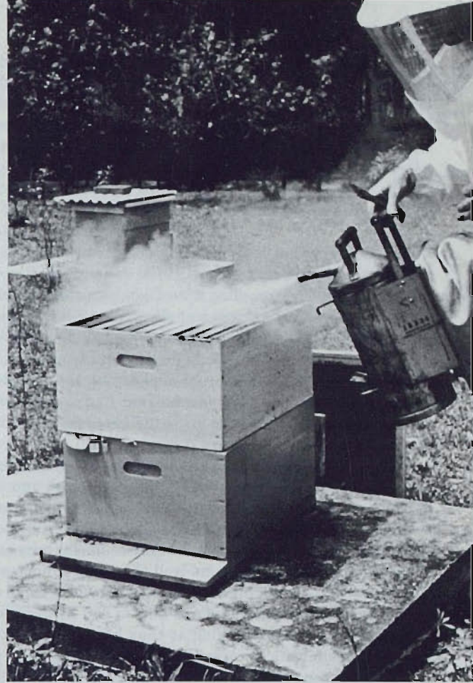
Beekeepers in Brazil use larger smokers than do American beekeepers.