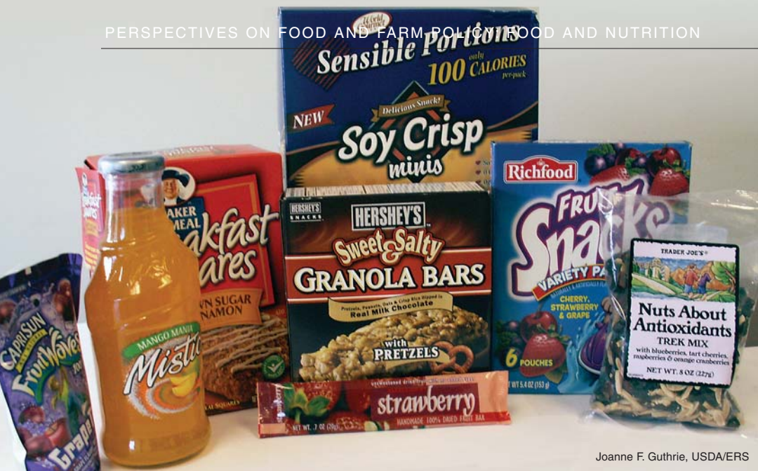
Joanne F. Guthrie, USDA/ERS

Food companies have responded to increased interest in health and diet with a myriad of products.