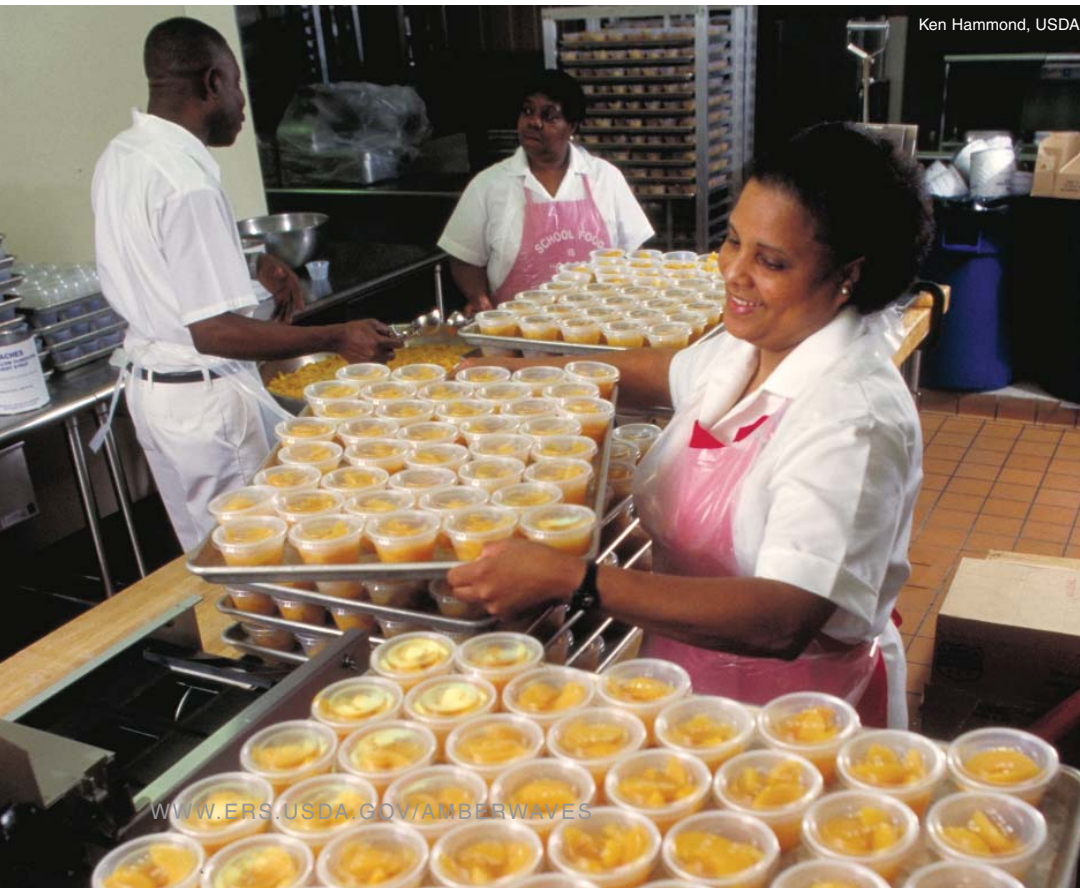
Ken Hammond, USDA

Despite Federal regulations, many NSLP lunches do not actually meet fat and nutrient requirements. The most recently available data, the 2005 School Nutrition Dietary Assessment (SNDA), showed improvement in saturated fat content from the 1998-99 SNDA, but it found that only one in four elementary schools served lunches that met the standard for fat and one in three met the standard for saturated fat. For high schools, the numbers were even lower: 1 in 10 for fat and 1 in 5 for saturated fat.